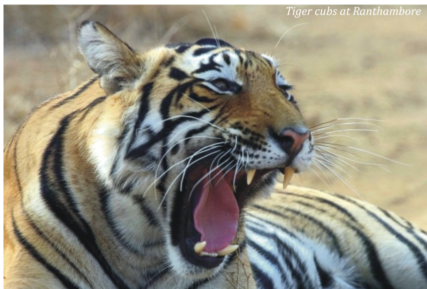
Tiger cubs at Ranthambore