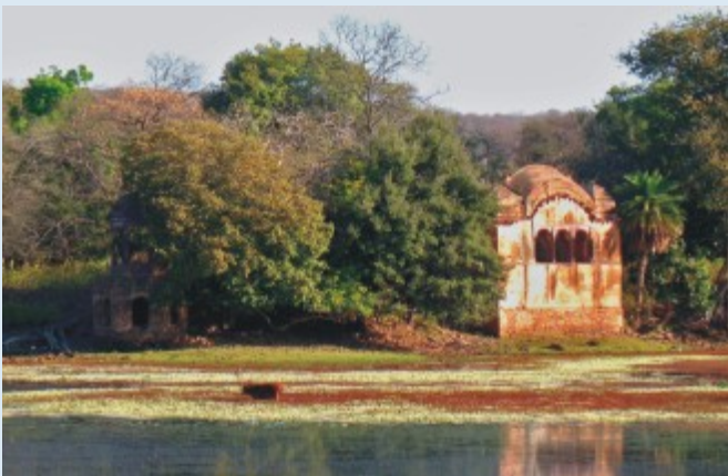
Ranthambore Tiger Reserve

Fatehpur Sikri is regarded as Emperor Akbar's crowning architectural legacy. Its numerous palaces, halls, and masjids (mosques) display his creative and aesthetic impulses, typical of Mughals. The city is a World Heritage site. Architect or layperson, this city generally captures the imagination and wonder of all who experience its urban spaces and see its buildings. Eventually, it is believed that water sources dried up and the fort city had to be abandoned.