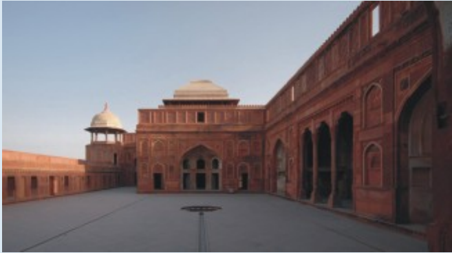
Red Fort, Agra

Agra is famous as being home to one of the Seven Wonders of the World - the "TAJ MAHAL". The architectural splendor of the mausoleums, the fort and the palaces is a vivid reminder of the opulence of the legendary Mughal Empire, of which Agra was the capital in the 16th and early 17th century. A pleasant town with a comparatively slow pace, Agra is known for its superb inlay work on marble and soapstone by craftsmen who are descendants of those who worked under the Mughals. The city is also famous for its carpets, gold thread embroidery and leather shoes.