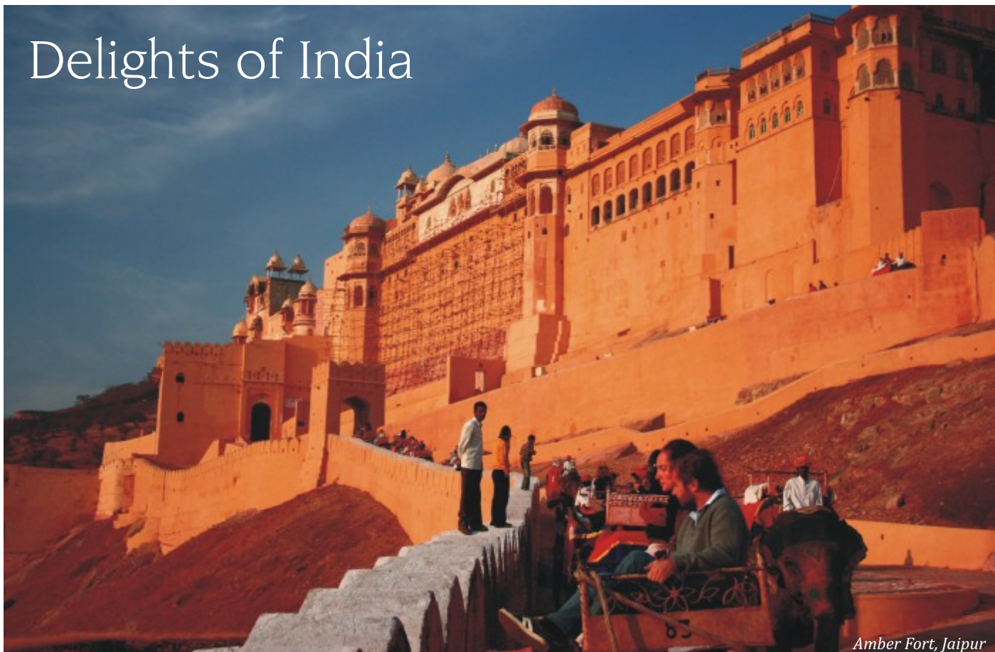
Amber Fort, Jaipur

Delights of India combines the ancient with the modern and nature's wonders with man's achievements. An amazing tour comprising the three famous cities Delhi, Agra and Jaipur along with fascinating abandoned city of Fatehpur Sikri and the erstwhile royal hunting ground (now a protected tiger reserve) of Ranthambore. The tour clubs royal Rajasthan with the city of Agra, home to the inimitable Taj Mahal besides the dazzling and delightful Delhi. The tour is probably the best introduction to India for first time travellers to this amazing country.