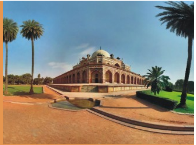
Humayun's Tomb, Delhi

Many of those well-preserved palaces and mansions are now museums, or heritage hotels, making Jaipur one of the few big cities in India where walking around is a sheer pleasure. Whether through stately avenues or through the jumble of Jaipur's walled city - full of bazars, the bustle of cows, camels and rickshaws, discover this historic rajput city on foot. There is so much to see and absorb in Jaipur.