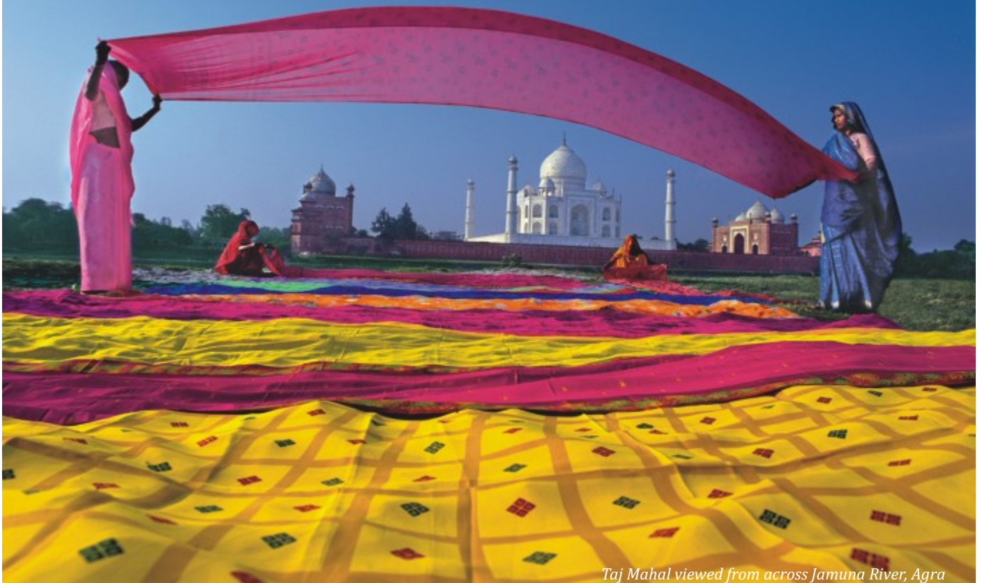
Taj Mahal viewed from across Jamuna River, Agra

A wonderful introduction to India, this tour aims to incorporate the different facets of the country, from the political grandeur of Delhi to the artistic perfection of the Taj Mahal and finally to the regal palaces and fortresses of the Rajput Maharajas. Taken together, the tour offers visitors a fascinating insight into the mysteries of India.