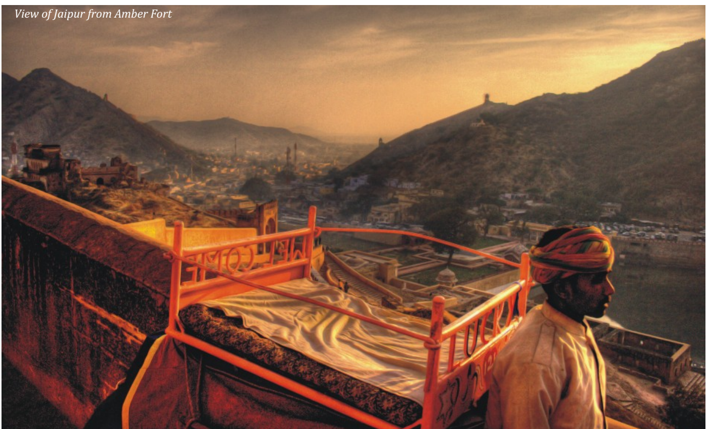
View of Jaipur from Amber Fort

A wonderful introduction to India, this tour aims to incorporate the different facets of the country, from the political grandeur of Delhi to the artistic perfection of the Taj Mahal and finally to the regal palaces and fortresses of the Rajput Maharajas. Taken together, the tour offers visitors a fascinating insight into the mysteries of India.