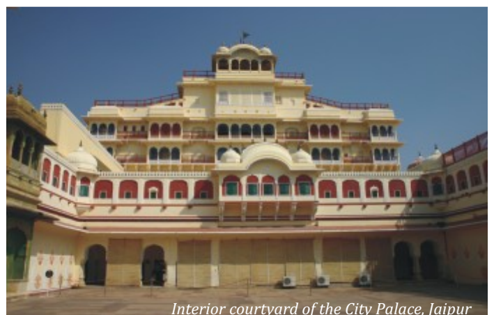
Interior courtyard of the City Palace, Jaipur