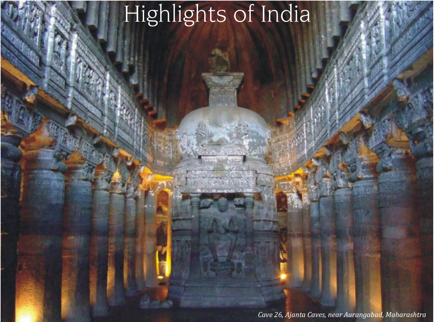
Cave 26, Ajanta Caves, near Aurangabad, Maharashtra