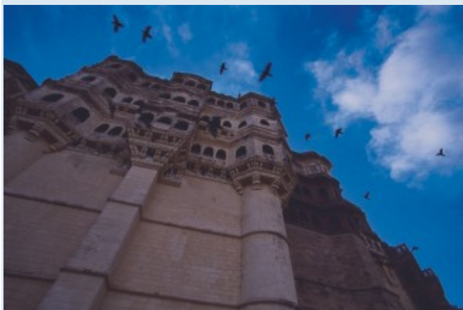
Meherangarh Fort, Jodhpur

Set at the edge of the Thar desert, the imperial city of Jodhpur echoes with tales of antiquity in the emptiness of the desert. Once the capital of the princely state of Marwar, Jodhpur is now the second largest city of Rajasthan. The Meherangarh Fort dominates the skyline of Jodhpur where alleys are filled with vibrant colours and bustling bazaars offer silver, antiques, woodwork and textiles galore.