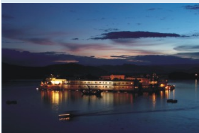
Lake Palace, Udaipur

A magical city of lakes and palaces, Udaipur is India's most romantic town. This centre for artists, dancers and musicians offers plenty to do and some great roof-top cafes to chill out in.