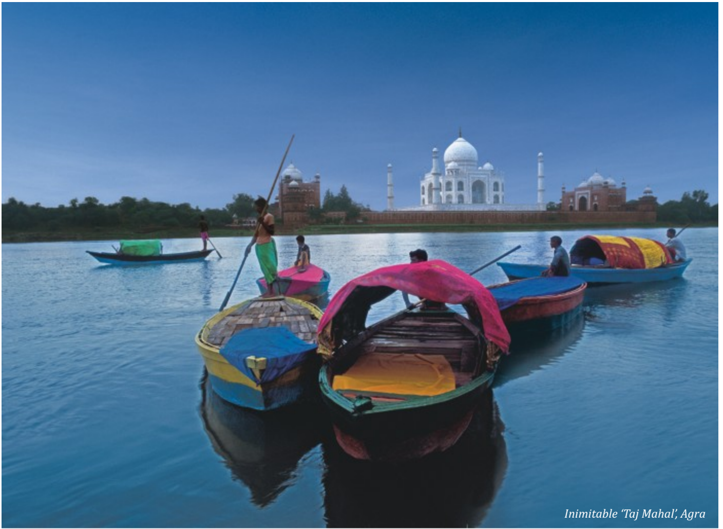
Inimitable 'Taj Mahal', Agra