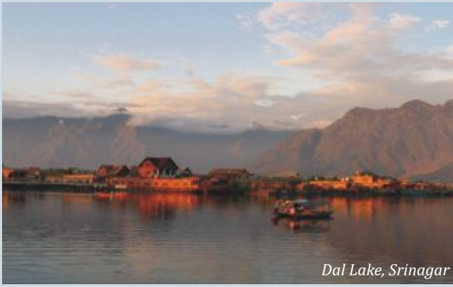
Dal Lake, Srinagar