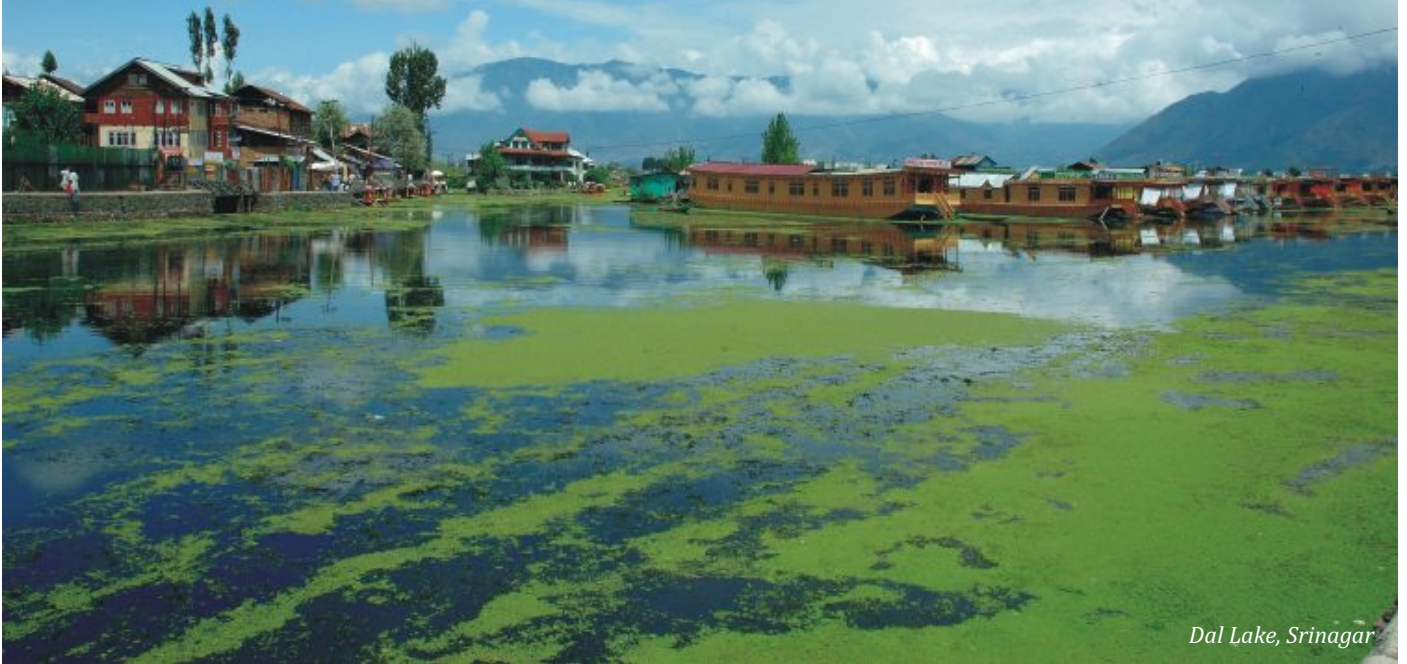
Dal Lake, Srinagar

This eight days tour takes you on a fascinating journey through the northern most Himalayan state of India – Jammu and Kashmir. You will traverse through two distinctly culturally different regions of the state – one influenced by central asian culture and the other which is totally tibeto-buddhist.