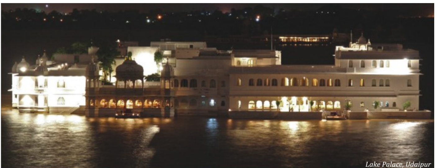
Lake Palace, Udaipur

Marble palaces rising from idyllic lakes - like gems studded in a setting of azure. Dunes and craggy citadels. Ruins that whisper legends. Picture-book cities in the folds of mountains. Regal opulence that lingers in ceremonial pomp. Men in vivid turbans and women adorned in shimmering silver. Tales of valour and chivalry. All vibrant images of the dazzling mosaic that is the state of Rajasthan.