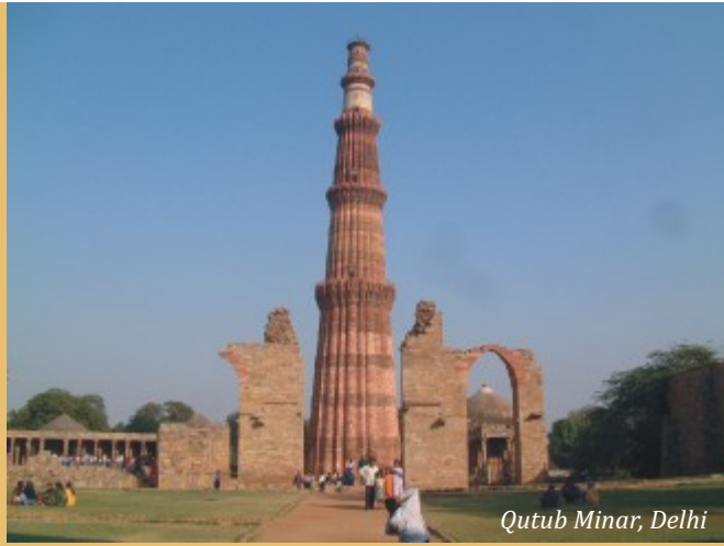
Qutub Minar, Delhi