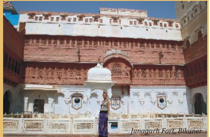
Junagarh Fort, Bikaner

Palaces, havelis and public gardens are its other treasures, and an enduring culture of graciousness marks Bikaner as an important link in the desert. Also linked to Shekhawati and Jaipur trails, this is a true camel country. But, whether you sit aloft a camel, or in a more mundane tourist coach, you'll find it easy to relive an era when the maharajas ruled from their splendid palaces, caparisoned armies went to war in full regalia, and beautiful princesses chose death over dishonour.