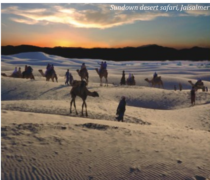
Sundown desert safari, Jaisalmer