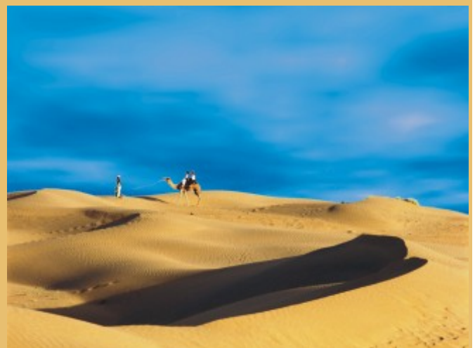
Desert Safari, Sam Desert, Jaisalmer

Jaisalmer is by far the oldest of the ancient capitals of Rajasthan. Its history dates back to 1156 A.D. The skyline holds kiosks with parapets, balconies and terraces. It is hard to believe that the human hand is capable of executing the intricate stone carvings on these structures - no corner is left unadorned. The beauty of the Jain temples (12th - 15th centuries) leave visitors breathless and photographers usually run out of film. For anyone who wishes to understand the true spirit of historic Rajasthan, Jaisalmer is the richest source of sights, sounds and impressions.