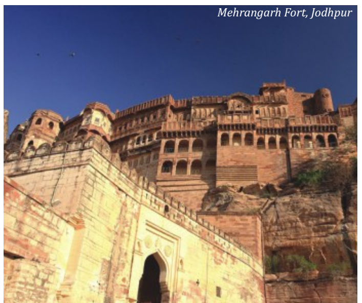
Mehrangarh Fort, Jodhpur