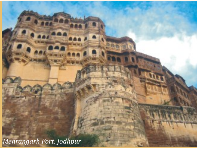
Mehrangarh Fort, Jodhpur