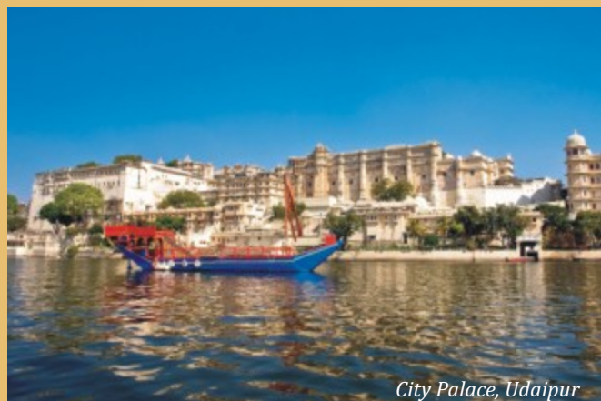
City Palace, Udaipur

Set at the edge of the Thar desert, the imperial city of Jodhpur echoes with tales of antiquity in the emptiness of the desert. While the graceful palaces, forts and temples strewn throughout the city bring alive the historic grandeur, exquisite handicrafts, folk dances music and the brightly attired people lend a romantic aura to the city.