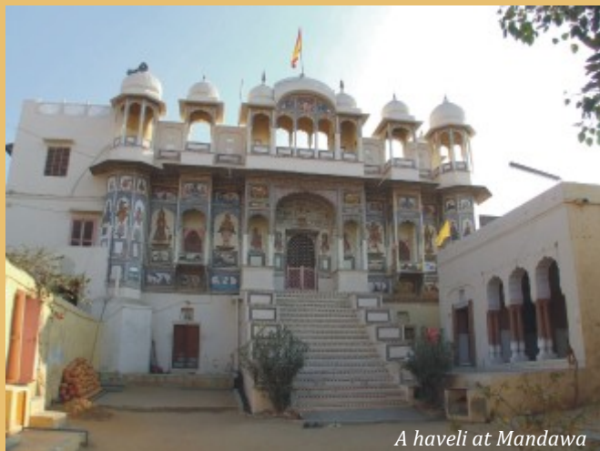
A haveli at Mandawa

In Delhi, the capital of India, history brushes shoulders with modernity quite casually, and this endows it with an ancient soul with a unique appeal. The city, or rather the seven cities of Delhi prior to Lutyens Delhi has also witnessed the rise and fall of many empires. The majestic monuments in Delhi reflect its rich, glorious and troubled past in stones for you to see...and also hear.